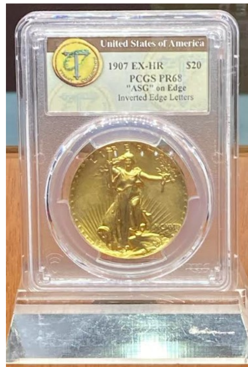
The PR68 1907 Ultra High Relief Double Eagle ($20) from the Tyrant Collection