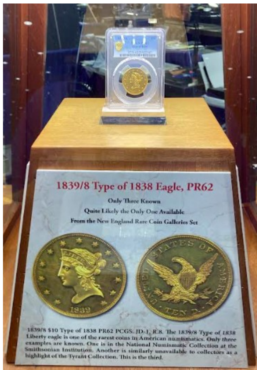
1839/8 Type of 1838 Eagle ($10)

The World's Fair of Money was at the Oklahoma City Convention Center and was located with walking distance of several hotels and an entertainment district near downtown OKC. The NBA Champion Thunder's home at the Paycom Center was also across the street. Some pictures from the show: