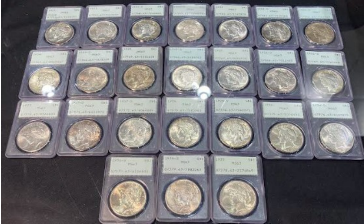
All the Peace Dollars