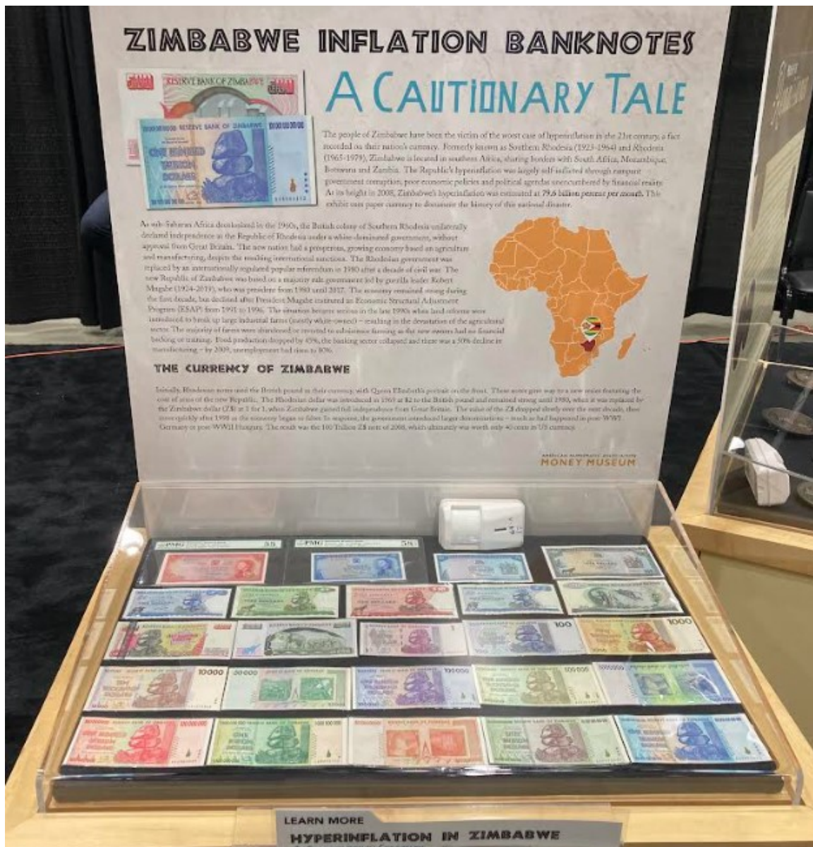
An ANA Money Museum display on the hyper-inflation era currency of Zimbabwe

Oklahoma City is a fine city to visit and I hope the ANA returns for future events in the Panhandle State.